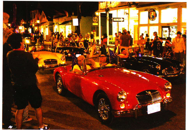
Duval Street Debauchery!