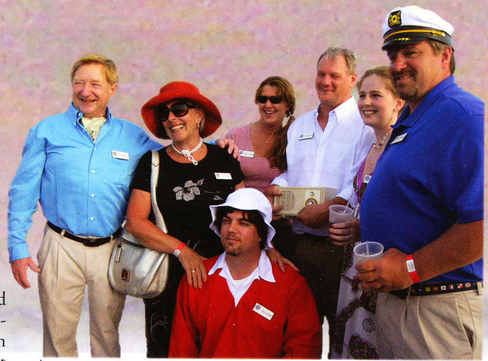
♪ ...Gilligan, The Skipper too, The millionaire and his wife, The movie star, The Professor, and Mary Ann ...