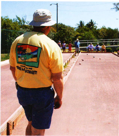
Where's My Mashie-Niblick?

With the parade route completed, bead supply exhausted, we returned to the Blue Marlin to recap the event and relax before Friday's main event – the Bocce Ball tournament. With fourteen teams of four, each game was an elimination round for one of